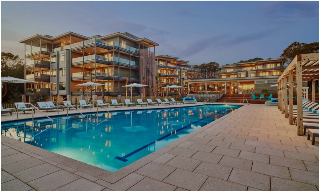
The pool area and beach club is the centerpiece of activity at the new Timbers Kiawah.

KIAWAH ISLAND, S.C. — Whenever my family goes on vacation, my wife and I will kick the tires on the idea of, one day, living in that destination seasonally. We might even poke around Trulia at vacation homes in the area.